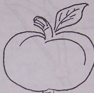
Green Granny Apple