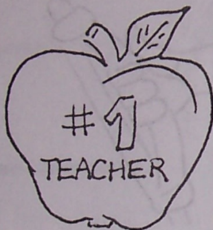
Red Delicious Apple