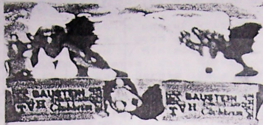
Orange Base with Black Lettering