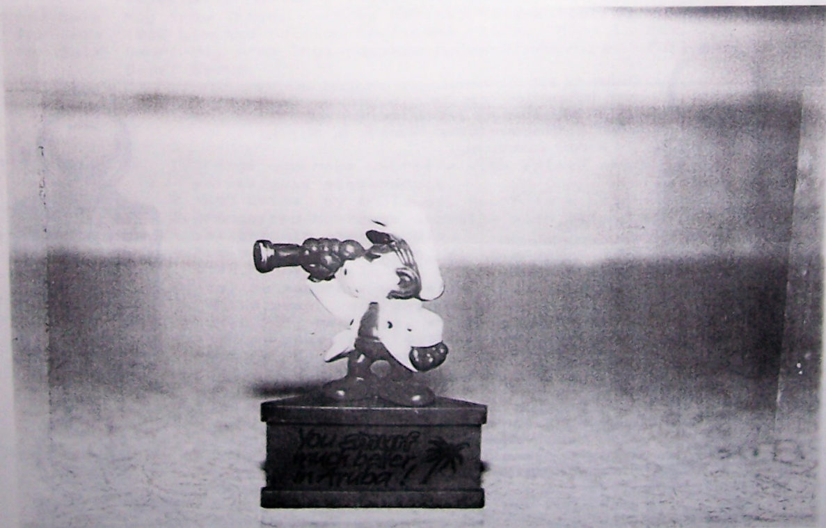
Marked 1980 Schleich W. Germany

"You Smurf much better in Aruba!" (Blue base with black lettering, and a Palm Tree!)