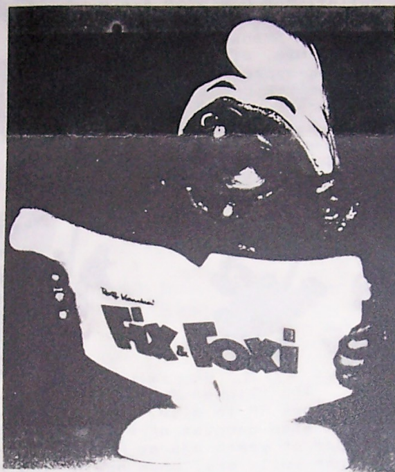
SMURF # 20038

"Fix & Foxi" is a German comic strip publisher who also printed "Smurf Adventurers" in Germany."