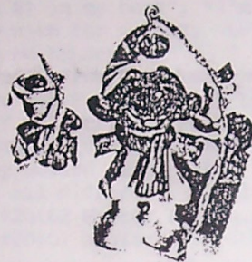
--"BELL RINGER" PHOTO OF ACTUAL SMURF FIGURINE!

Does anyone admit to owning this piece? If so, verification for our records would be deeply appreciated!!